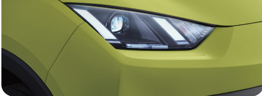
Sharp headlight design with standard DRLs