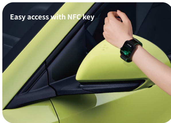
Easy access with NFC key