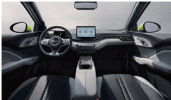
Black and grey