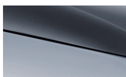
Skiing white + Urban grey