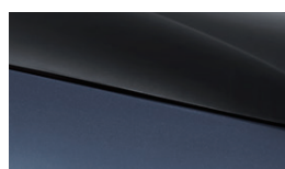
Atlantis grey + Jet black