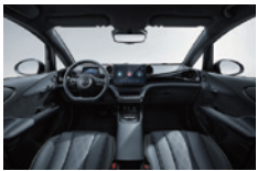
Black and grey