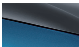
Surfing blue + Urban grey